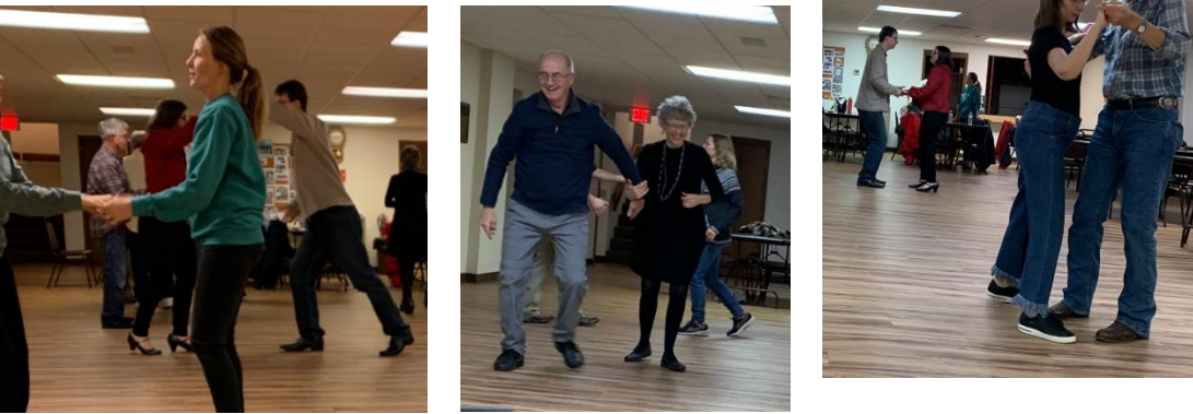
Join the fun on the second Friday of each month through March!